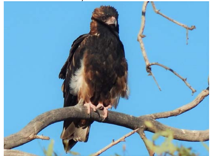
Photos Eyrean Grasswren - Pam Kenway: Black-breasted Buzzard - Barbara Cooper